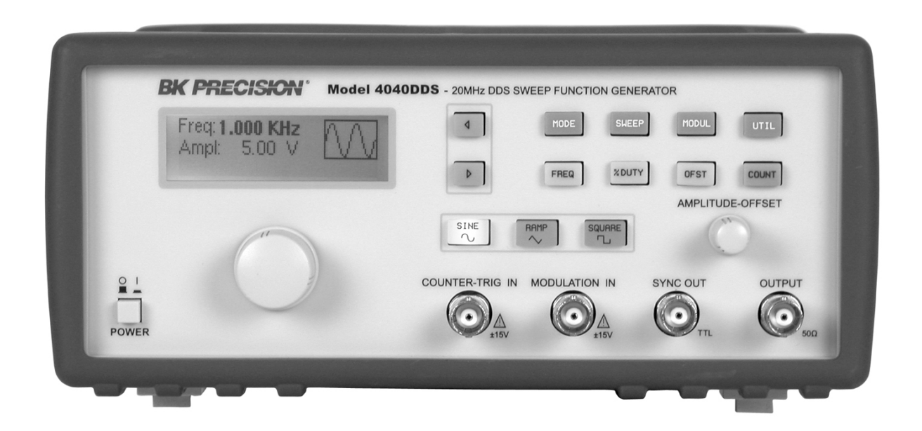
Figure 3.1 - MODEL 4040DDS Front Panel

This section describes the displays, controls and connectors of the MODEL 4040DDS - Function Generator. All controls for the instrument local operation are located on the front panel. The connectors are located on both front and rear panels.